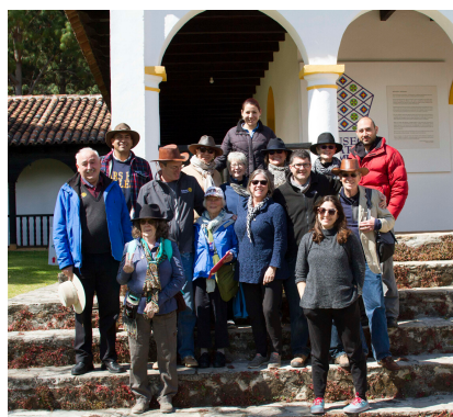
MUSEO JTATIK SAMUEL

Travel insurance will be available with an Asheville Sister Cities membership.